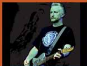
Billy Bragg 5 November £22