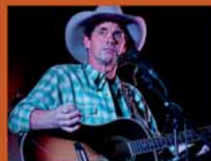
Rich Hall's Hoedown 17 November £17