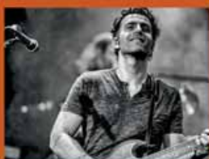
Dweezil Zappa 13 October £44.50 £34.50