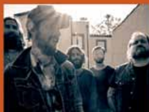
Band of Horses 5 September £22.50