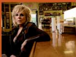
Lucinda Williams 4 September £32.50, £27.50