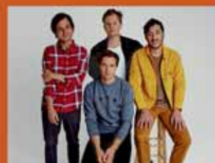
Grizzly Bear 10 October £25