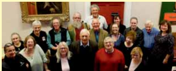
Some of the Hastings Week Committee

Again we have the favourites, such as the Classic Car Show, Jazz, a torchlight procession (by the Hastings Bonfire Society) and the fireworks, which we hope you will continue to support. Don't forget to look out for new events like the Vintage Bike Show at the Stade. I would also like to personally thank all those who have sponsored the production of the Hastings Week