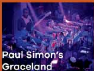
Paul Simon's Graceland performed in full by The London African Gospel Choir 28 October £19